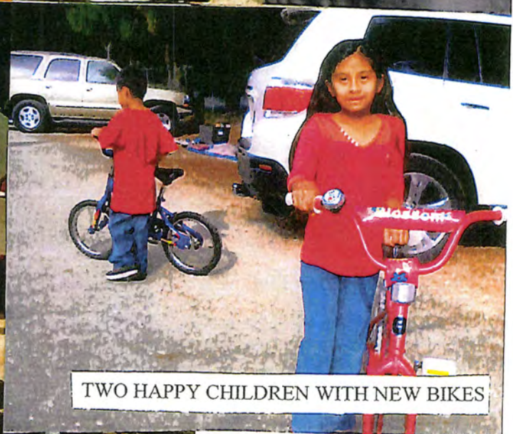
TWO HAPPY CHILDREN WITH NEW BIKES