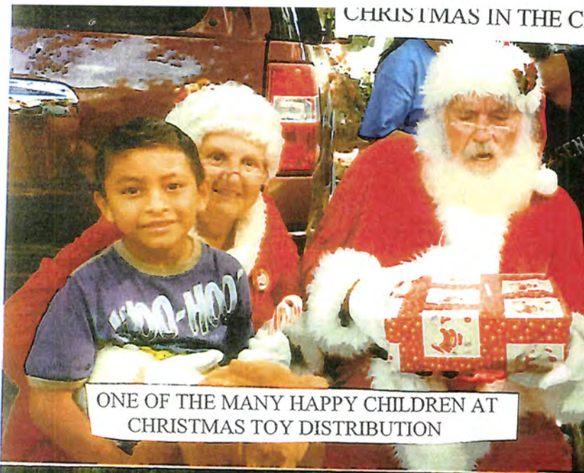
ONE OF THE MANY HAPPY CHILDREN AT CHRISTMAS TOY DISTRIBUTION