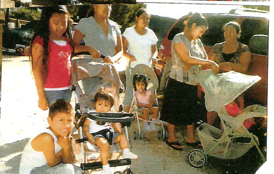
SOME MOMS AND BABIES LINE UP TO HEAR GOD'S WORD (LOTS OF BABIES IN THE CAMPS THIS YEAR)