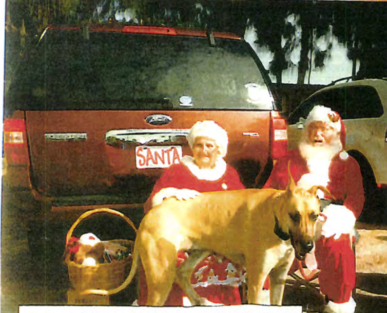
MR. & MRS. SANTA WITH "BLITZEN"