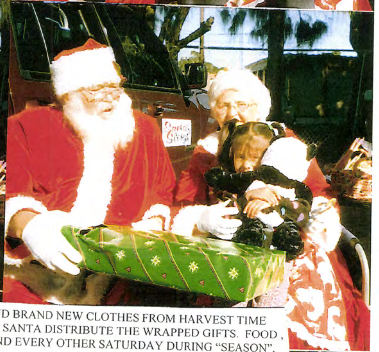
140 CHILDREN RECEIVED CHRISTMAS GIFTS OF TOYS AND BRAND NEW CLOTHES FROM HARVEST TIME PICTURED ARE A FEW OF THE CHILDREN AS SANTA & MRS. SANTA DISTRIBUTE THE WRAPPED GIFTS. FOOD, CLOTHING & OTHER ITEMS WERE GIVEN ON THIS VISIT AND EVERY OTHER SATURDAY DURING "SEASON".